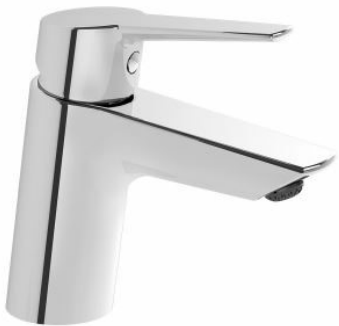
Product Code: A42440EXP